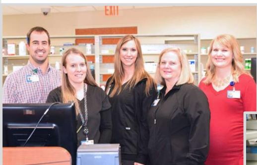
Top Photo: Trinity Regional Medical Center, Fort Dodge, IA. Right Photo: St. Luke’s Medical Center, Sioux City, IA.